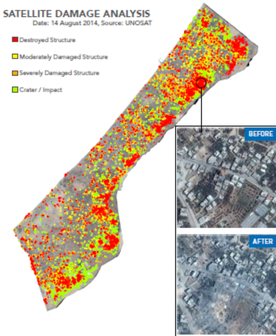
Figure A1: Damages